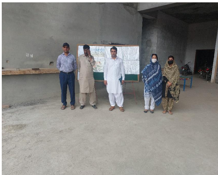
Fig. 7: DGM&E team with project stakeholders