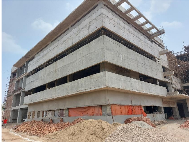
Fig. No. 2: Work in progress (main building)