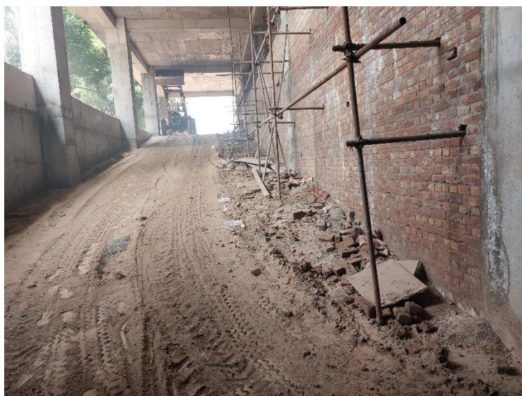
Fig. 4: Ongoing work in main building