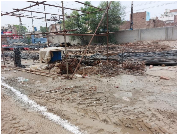
Fig. 6: Remaining external development works and improperly stored material at site