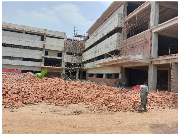
Fig. 3: Ongoing work in main building