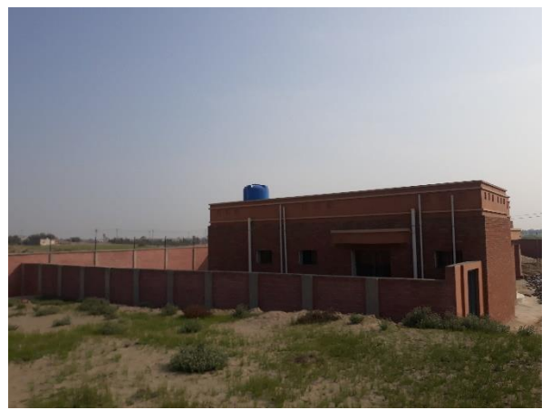
Figure 6: View of Residence