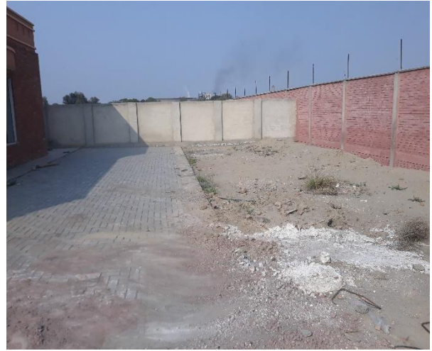
Figure 2: Pending Horticulture works