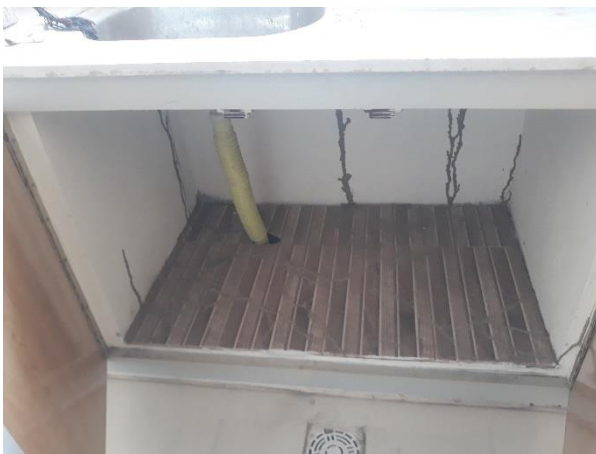
Figure 3: Termite Attack