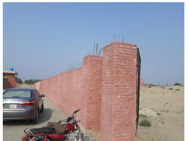
Figure 4: Lights at the top of gate pillars are still missing