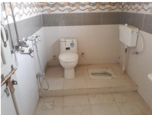
Figure 5: Sanitary fixtures