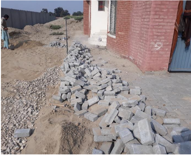
Figure 1: Remaining Works